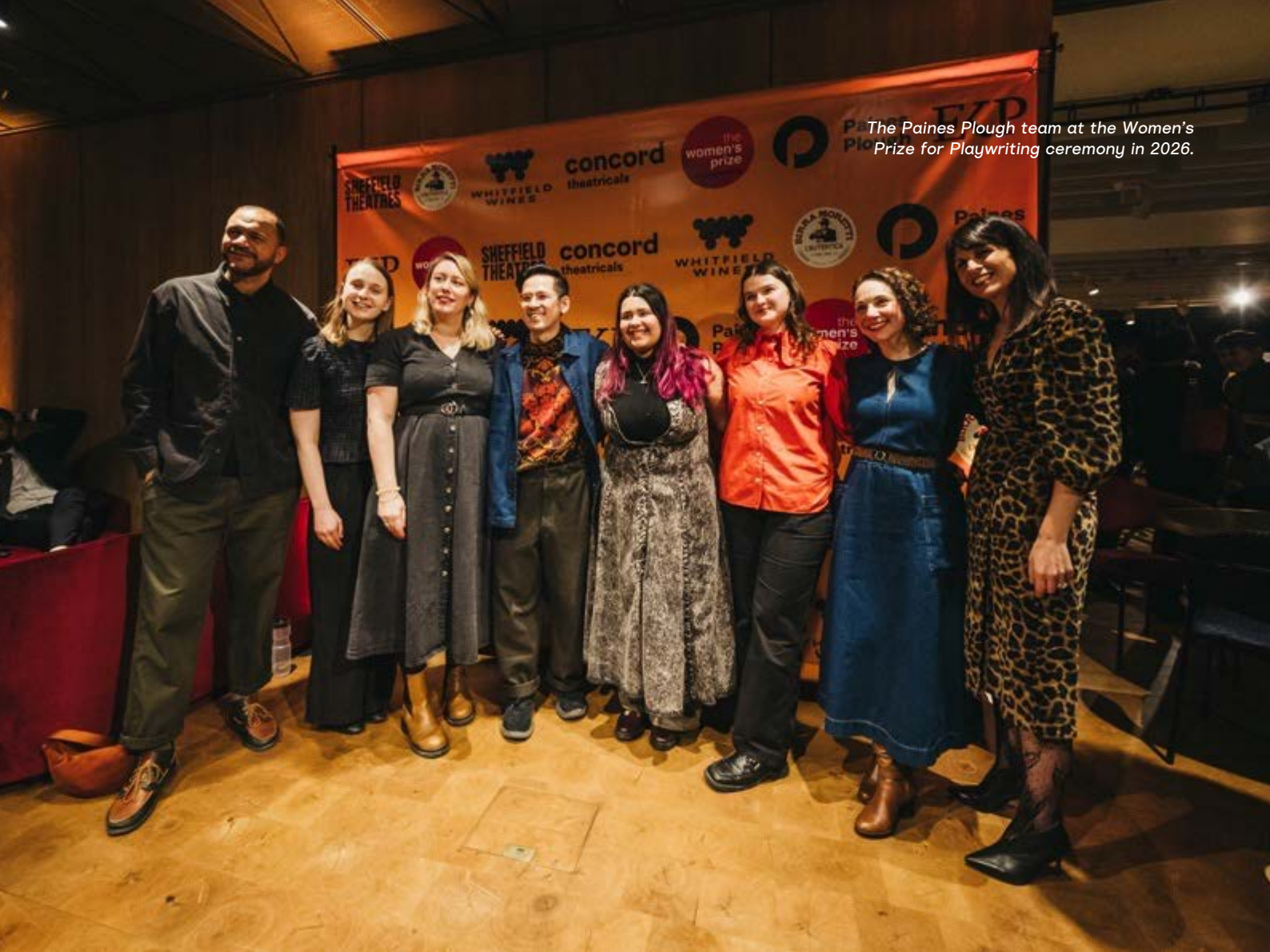
The Paines Plough team at the Women's Prize for Playwriting ceremony in 2026.